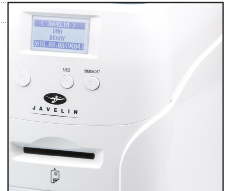
Easy to read 4 line LCD screen for clear notifications and prompts