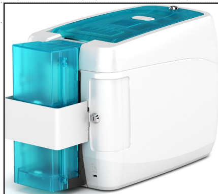
Additional security features and dual hopper option