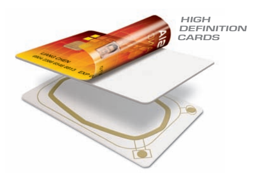
High Definition cards deliver the highest image quality layered on the highest functionality. HDP Film fuses to the surface of proximity and smart cards. It conforms to ridges and indentations formed by embedded electronics, and provides an extra layer of card durability and security.

Cards produced by High Definition Printing are inherently more durable and secure than other types of cards. They resist wear and tear by putting a durable